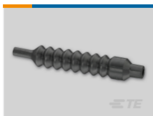
TE Part #806252-000 Convoluted Heat Shrink Uni Boots: Lipped, Straight