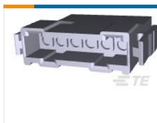
TE Part #207376-1 HSG,RECEPT 6 POSN,METRIMATE